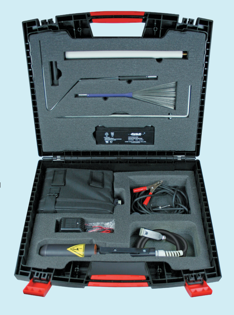
Basic delivery set of K-series Holiday Detector

Additional equipment depends on inspection application and is specified during order.