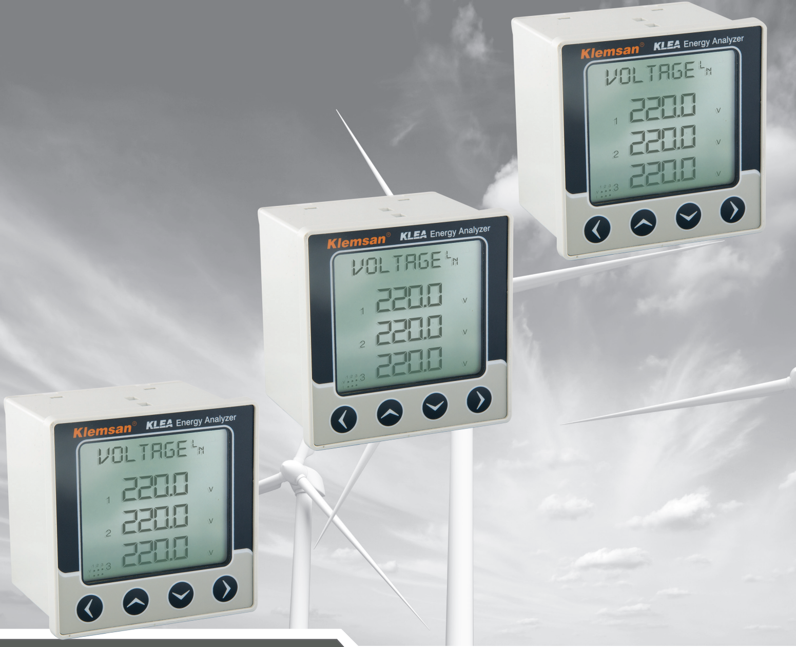
KLEA 220P ENERGY ANALYZER