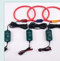
Model PQ34-30 3000A (24"/600mm) Flexible Current Clamp Probes for wrapping around busbars