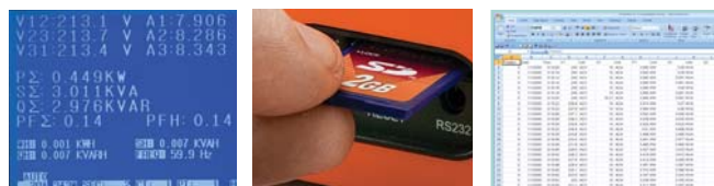
Backlit LCD displays numerical values. The data can be stored in SD memory card (included) and then transferred from meter to PC using Excel® software and datalogged readings.

Complete with 4 voltage leads with alligator clips, 8 AA batteries, SD memory card, Universal AC adaptor (100 to 240V), and case. Clamp probes sold separately.