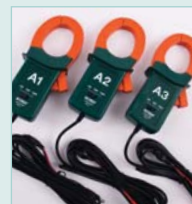
Model PQ34-12 1200A Current Clamp Probes with 2" (50mm) jaw opening