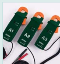
Model PQ34-2 200A Current Clamp Probes with 0.8" (19mm) jaw opening

Choose the best clamp probes to fit your application needs ranging from 200A to 3000A and flexible vs traditional jaw type.