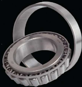
Single row taper roller bearings - in metric dimensions - in inch dimensions