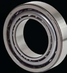
Single row angular contact ball bearing