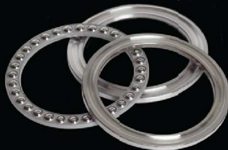
Thrust ball bearings - single direction - double direction