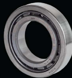
Single row cylindrical roller bearings - N, NU, NJ, NUP type