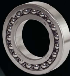
Double row self-aligning ball bearings - with cylindrical bore - with tapered bore