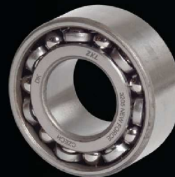
Double row angular contact ball bearing

„We surpass all... ...starting with automotive up to steel industry and power engineering.“