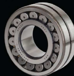
Double row spherical roller bearings - with cylindrical bore - with tapered bore