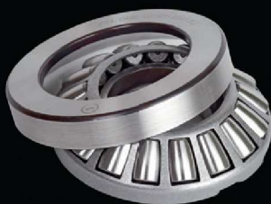
Spherical roller thrust bearings