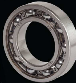
Single row deep groove ball bearings - with shields or sealing - with snap ring groove