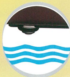
Waterproof Micro Switch