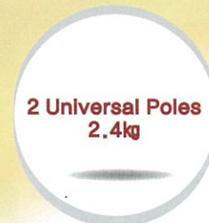
2 Universal Poles 2.4kg