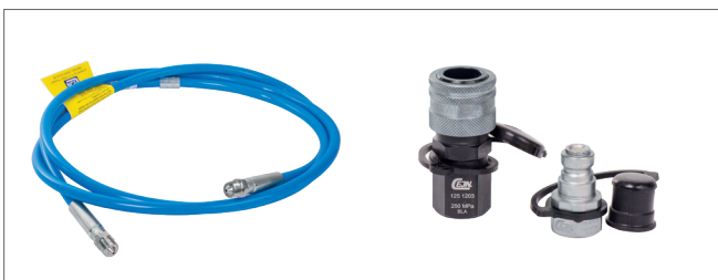
High Pressure Hoses and Couplings