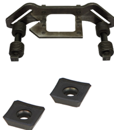
Cutting Insert (1 piece), sold 10pcs/box Product code: PLY-000282

Standard universal guide plate for beveling both plates and pipes \varnothing 150-300mm (6-12")