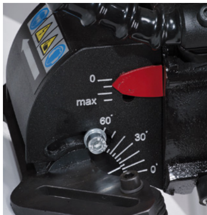
Continuous angle adjustment from 0 to 60 degrees.