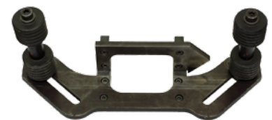
Optional guide for pipes \varnothing 260-600mm (10-24") Product code: PRW-0461-22-00-00