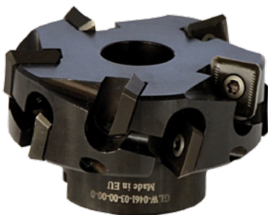
Mono block milling head, with 10 indexable inserts fixed with screws.

All information is subject to change without notice. 1407