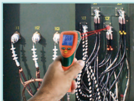
Fast response captures hot spots