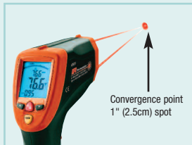
Two laser points converge at a distance of 50"/(127cm) and form a 1" (2.5cm) spot.