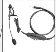
Earpiece/Headset NMN6246 BDN6780