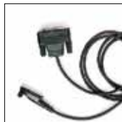
Programming Cable JMKN4123