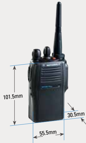
GP328 Plus with slim battery