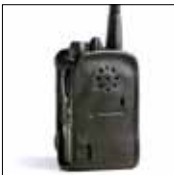
Soft Leather Case with Swivel Clip PMLN4421**