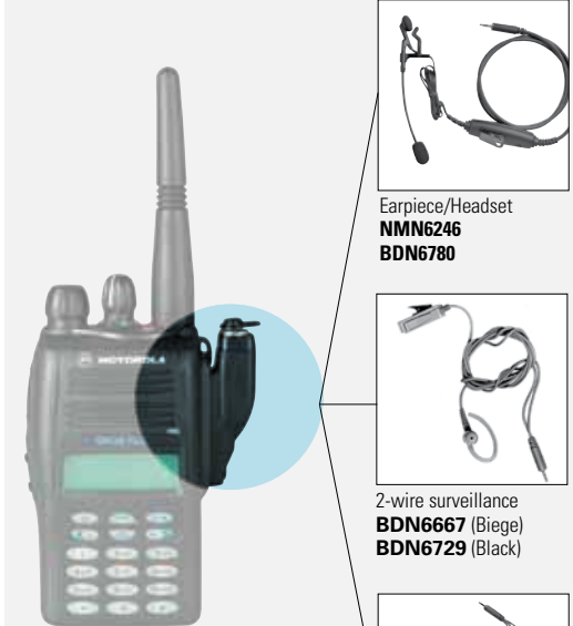
PMLN 4455 to be used with 3.5mm threaded range of Audio Accessories