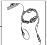
2-wire surveillance BDN6667 (Biege) BDN6729 (Black)