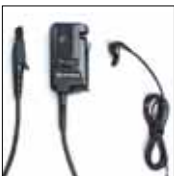
VOX/PTT Interface Module shown with JMMN4064 Ear Microphone BDN6768