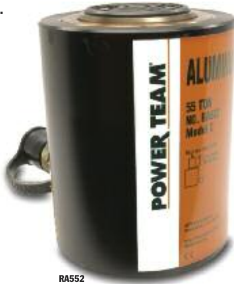
ASME B30.1 10,000 PSI