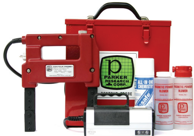
DA-400 SHOWN WITH "A/B" KIT ITEMS

WIDE VERSATILITY Mechanical flexibility plus selectively controlled solid state electronic features permit a vast field of applications. Mechanically, the Probe will conform to practically any surface configuration. The unique electronic circuitry contained in the molded handle permits selection of a strong constant AC magnetic field, or high intensity pulsed DC field.