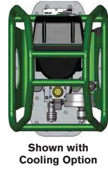
Shown with Cooling Option