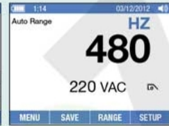
Low Pass Filter Mode