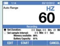
Datalogger Setup Menu