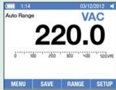
AC Voltage Mode