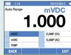
Clamp Adapter Setup Menu